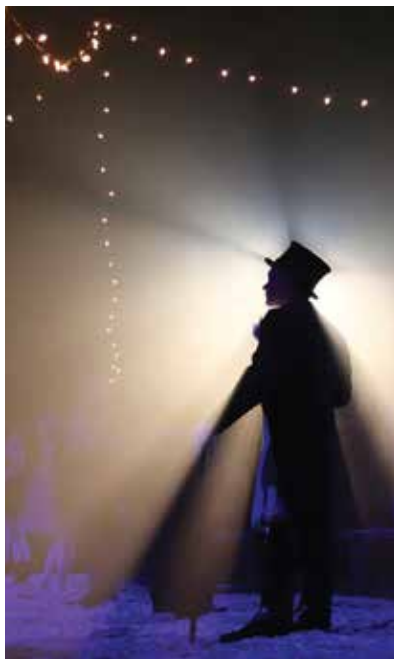
TOP: Carousel, 2016, BOTTOM: Elephant's Graveyard, 2015

For more information about Theater Department productions visit www.conncoll.edu/theater-season