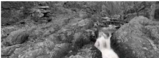
TOP: Timothy McDowell, See Visions, Dream Dreams , 2016, oil on linen with cyanotype