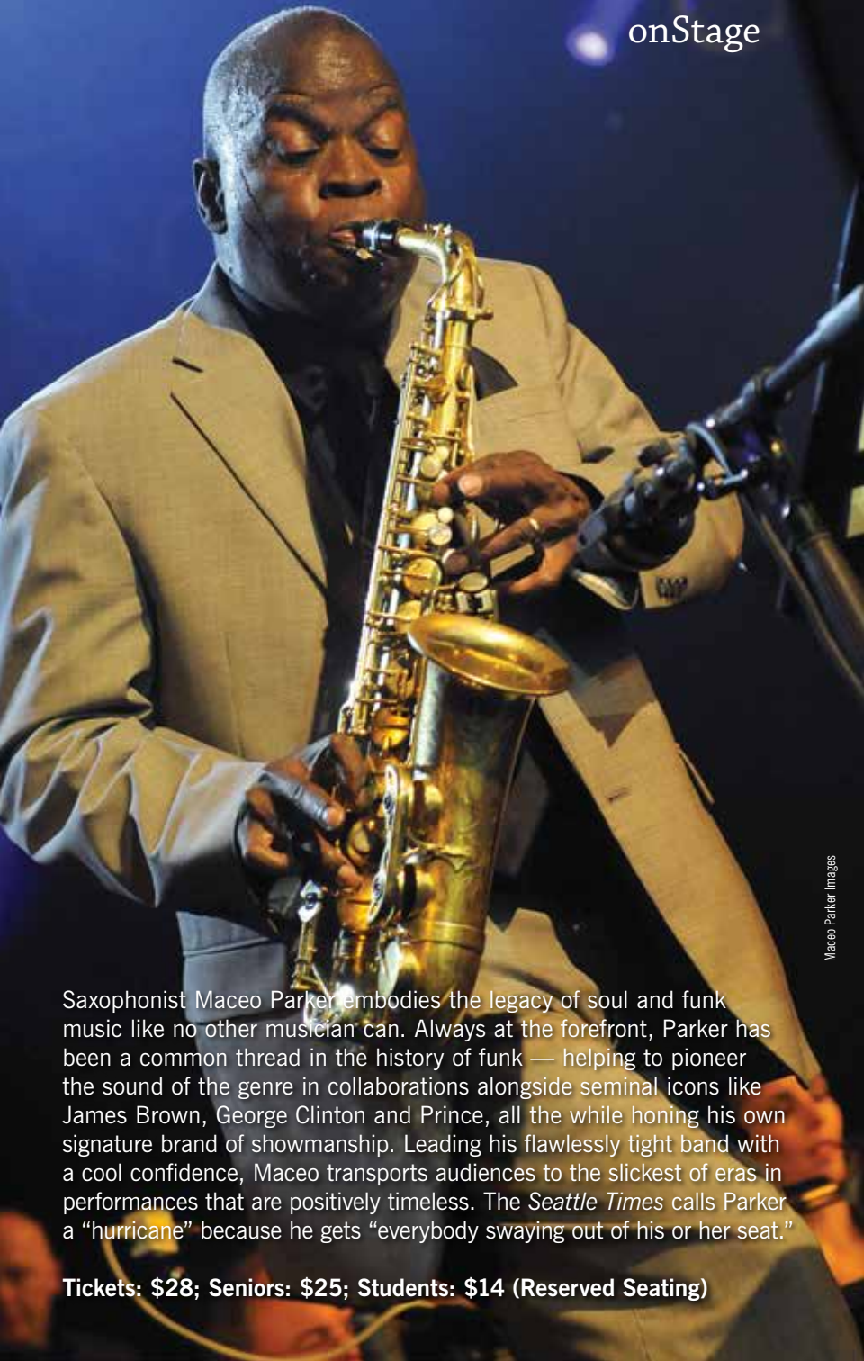
Maceo Parker Images

Saxophonist Maceo Parker embodies the legacy of soul and funk music like no other musician can. Always at the forefront, Parker has been a common thread in the history of funk — helping to pioneer the sound of the genre in collaborations alongside seminal icons like James Brown, George Clinton and Prince, all the while honing his own signature brand of showmanship. Leading his flawlessly tight band with a cool confidence, Maceo transports audiences to the slickest of eras in performances that are positively timeless. The Seattle Times calls Parker a “hurricane” because he gets “everybody swaying out of his or her seat.”