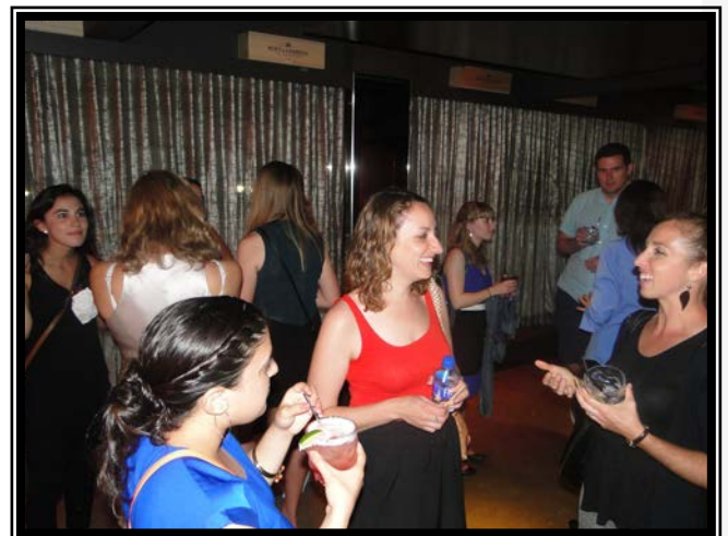
PICA alumni interacting at Boston Networking Event on June 13, 2015.