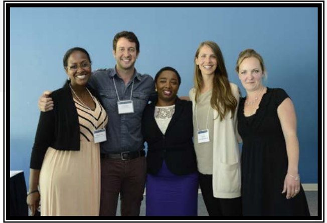
PICA alumni panelists after the panel discussion during Reunion Weekend in 2014.