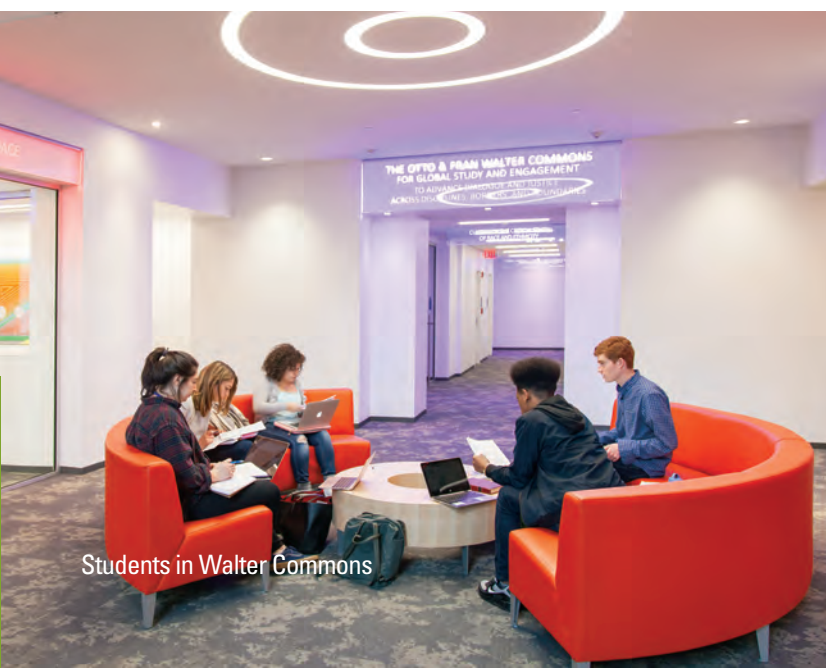
Students in Walter Commons